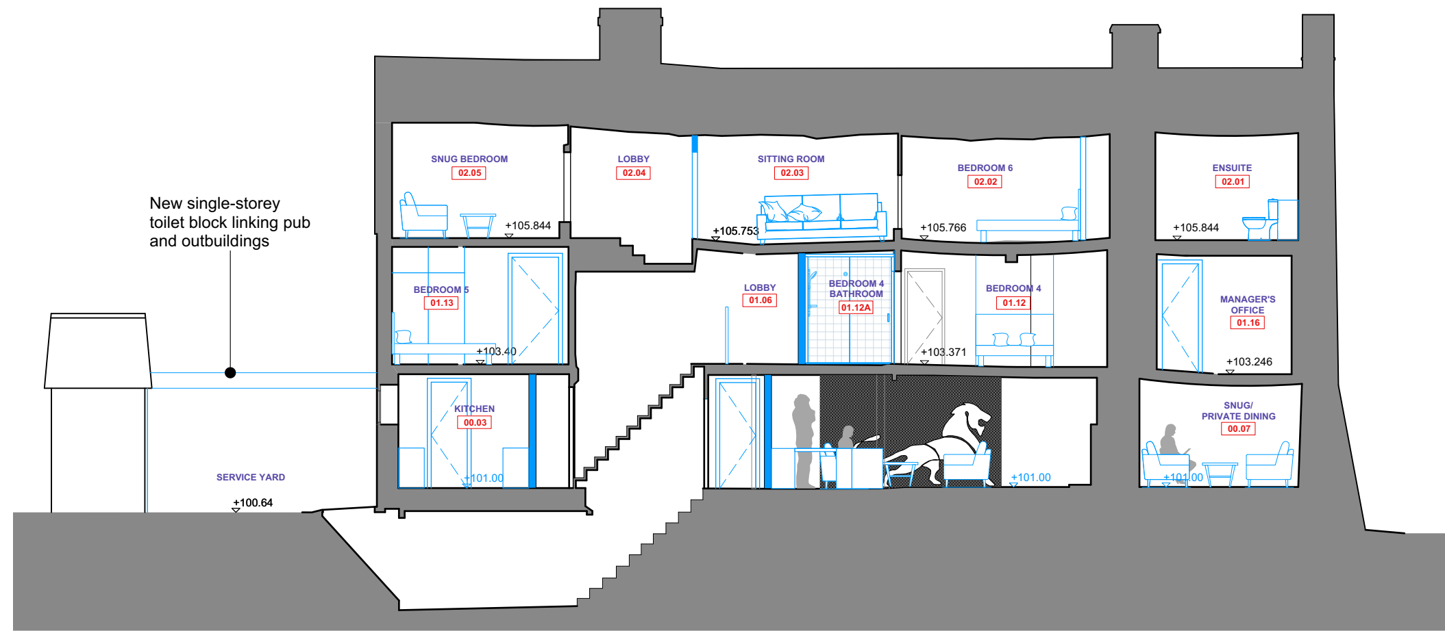
1 PROPOSED SECTION AA Scale: 1:100